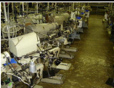
Union Special 35800