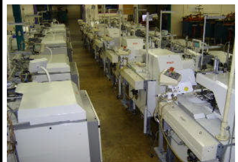
Pfaff 3568 Auto Set Pocket