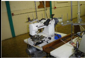
Singer 302 WaistBand