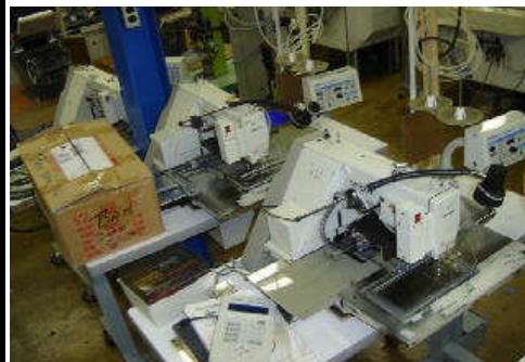
Brother BAS-311E, 326E