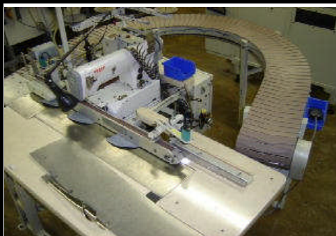
VMW Auto Pocket Hem