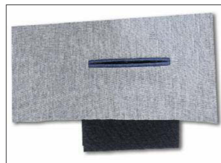
1 Double welt pocket with zipper

Setting welted pockets with integrated zipper and pocket pouches