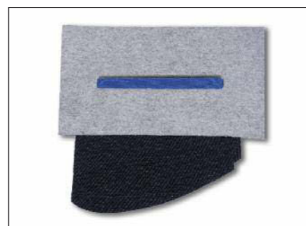
2 Single welt pocket with zipper