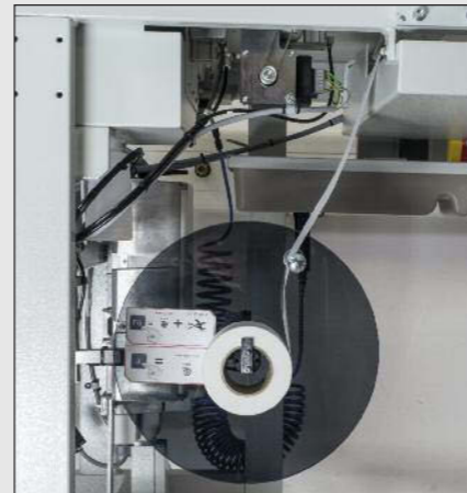
Stepper motor-controlled fleece feed