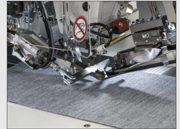
Pneumatic scissors for cutting off the endless zipper