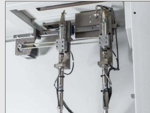
Cutter block with stepper motor drive