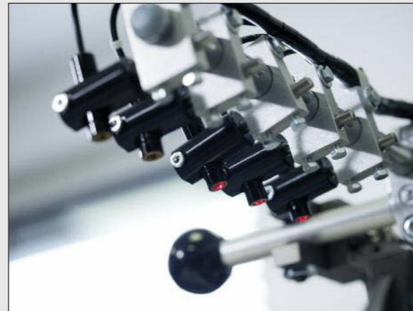
Laser markings indicate the exact pocket pouch position