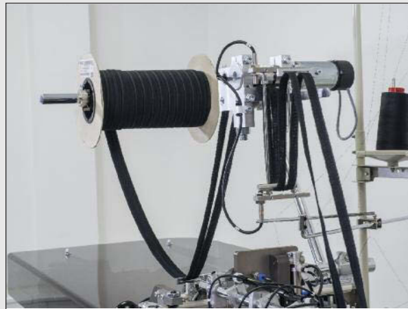
Automatic zip fastener extraction device

Sewing system for pocket openings with integrated endless zipper