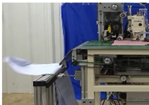
Simple Flip Stacking Device