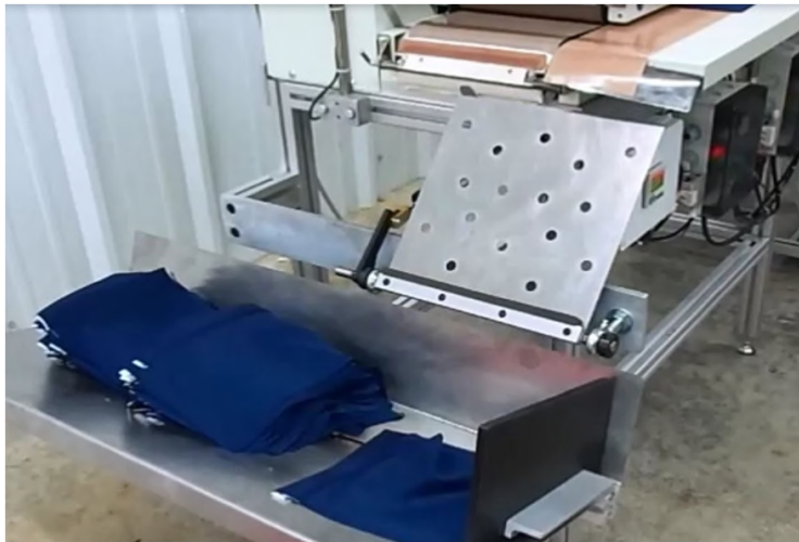
Stacking Platform with Adjustable Indexing Tray